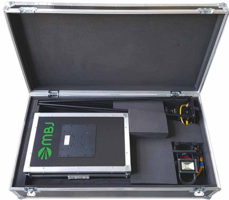
Compact and easy to use equipment